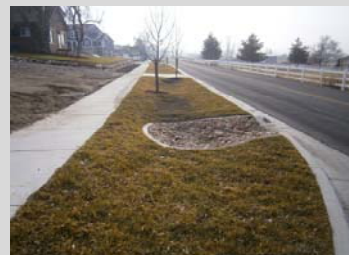
LID in Spanish Fork: vegetated swale with underground Infiltration gallery