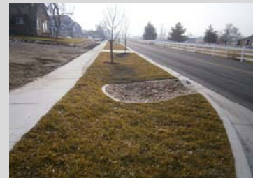
LID in Spanish Fork: vegetated swale with underground Infiltration gallery