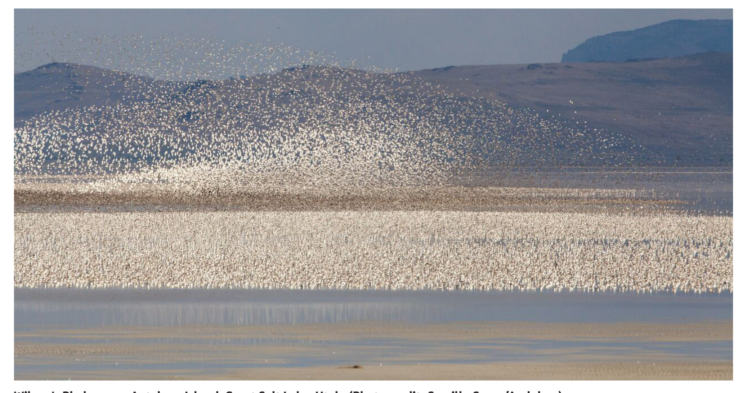
Wilson's Phalaropes, Antelope Island, Great Salt Lake, Utah.