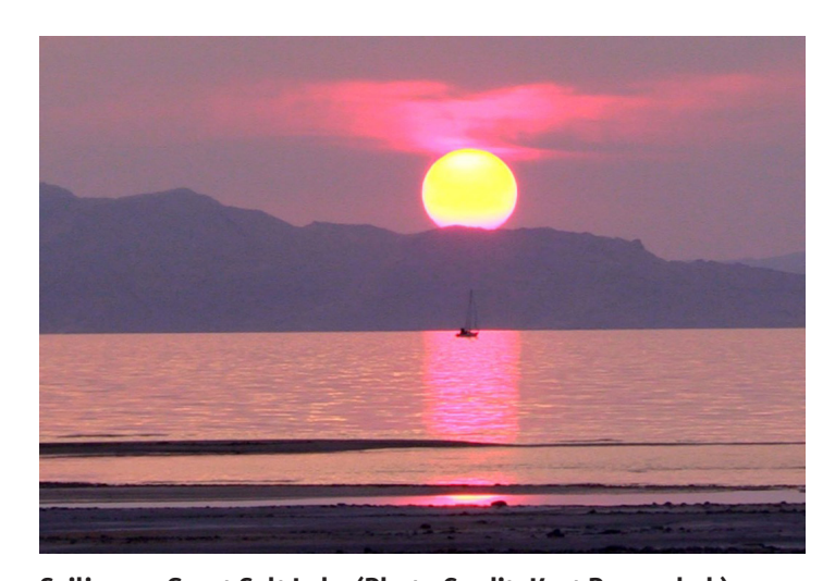
Sailing on Great Salt Lake

This report also recognizes that finding ways to integrate water planning and land-use decisions is essential. (See Strategic Opportunity #10). Historically, land use decisions do not take into account the impact that a particular development or pattern of development may have on either water demand or water infrastructure. Cumulatively, this can have negative long term and cascading impacts to Great Salt Lake levels and health. The recommendations suggest finding better ways to make sure that decisionmakers bridge that gap. A separate recommendation calls for stakeholders to better understand and grapple with how shifting patterns of land use affect the lake itself. (See Strategic Opportunity #11.) These deliberative strategies are important in linking state and local land use and water resource policies that are often developed out of context with one another and the lake itself.