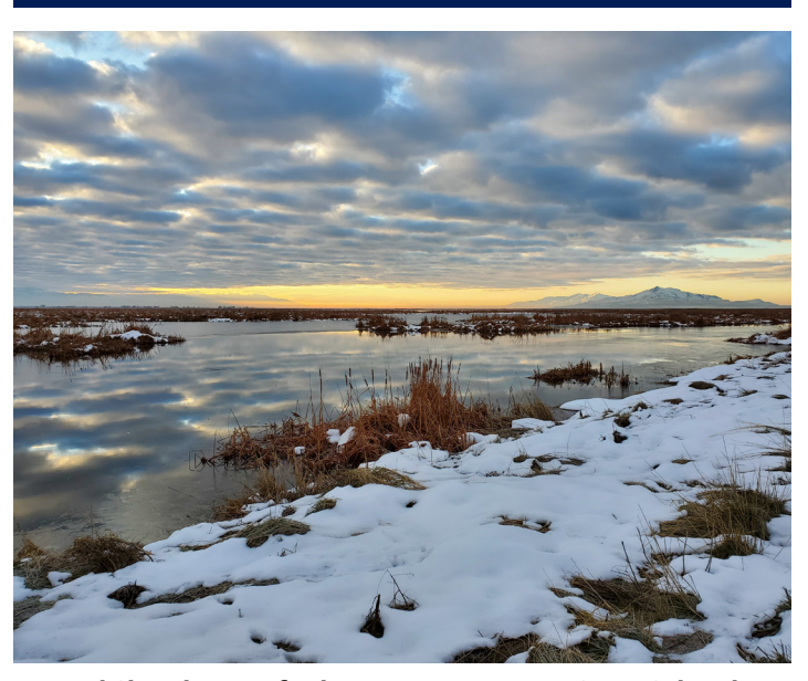
Howard Slough Waterfowl Management Area, Great Salt Lake

The Steering Group intends the recommendations in this report...as catalysts to spark continuing conversations, studies, and thoughtful decision-making.