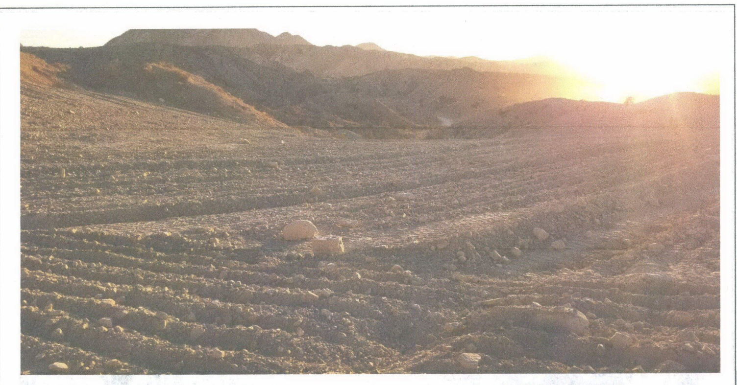
Photo 7: View facing south after top soil added, graded, and furrowed for runoff control (December 2020)