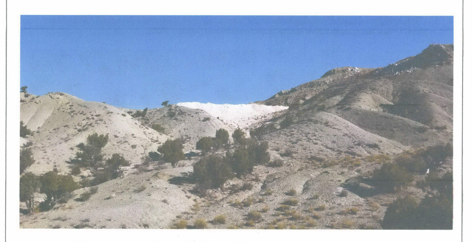
Photo 4: View facing north of piles of waste material from the GP plant (October 2020)