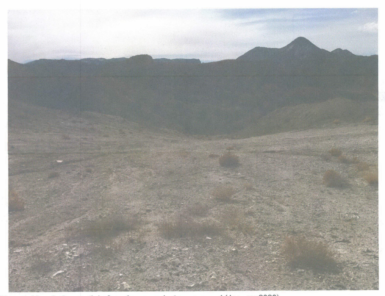
Photo 1: View facing south before closure project commenced (January 2020)