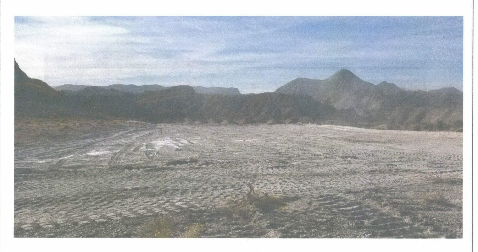
Photo 3: View facing south with piles of waste material from the GP plant (October 2020)