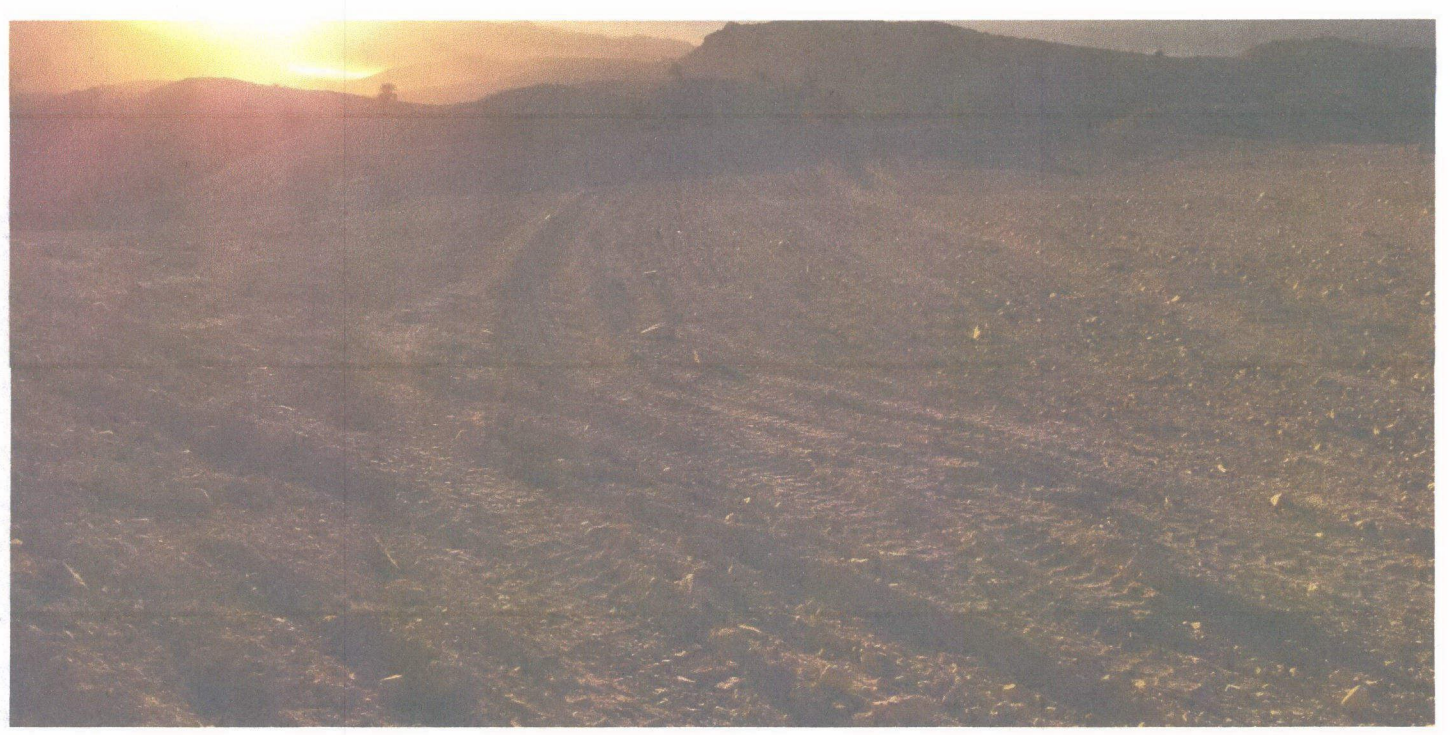
Photo 6: View facing west after top soil added and graded (December 2020)