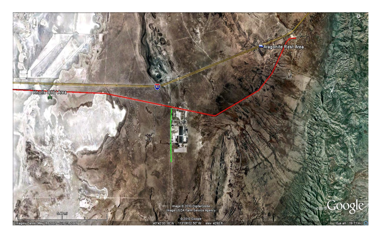
Figure 2. Off-site air dispersion locations (Note: red line is the rail; green line is UTTR access road).